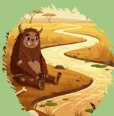
A monster lives in a forest nearby