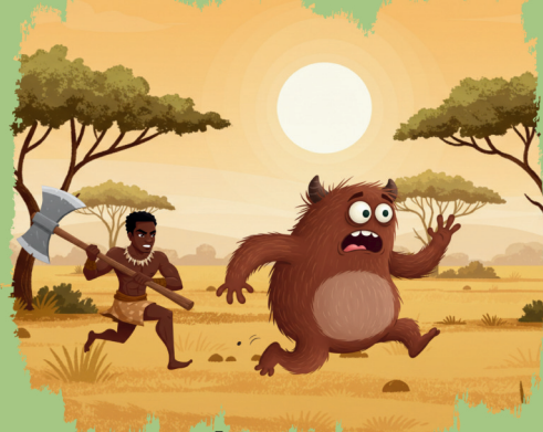
Muturi chases the monster away with an axe