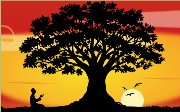
Gikuyu makes an offering to Ngai