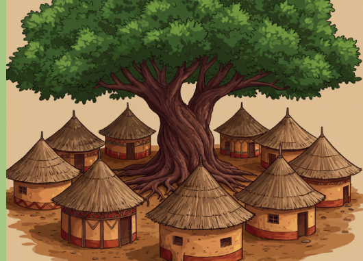
Their families become the Kikuyu tribe