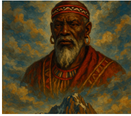
The Mighty Creator

Match the word pictures to the Kikuyu words