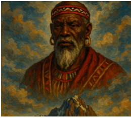
The Mighty Creator

Match the word pictures to the Kikuyu words